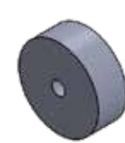
Fig. 3 .5" Spacer