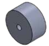
Fig. 4 .75" Spacer