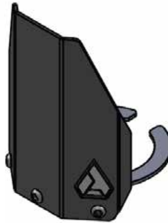
FIG. 2 Completed Assembly